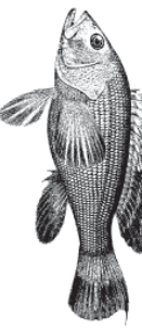
BLACK SEA BASS