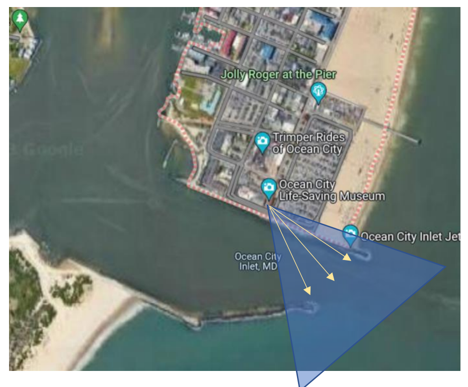
Figure 1. Project Location – OC Inlet

This memo supports an informational discussion at the March 2023 SSC meeting regarding a pilot project to use a video camera to count boats going through the ocean inlet in Ocean City, Maryland ("OC Inlet" hereafter). Full results will be presented at the Council's April 2023 meeting. The OC Inlet creates an observation point for all of Maryland's ocean recreational fishing effort. Using the back bays to the south or north to reach other ocean inlets is possible but not practicable. Likewise, running down the Chesapeake to the ocean is not practicable.