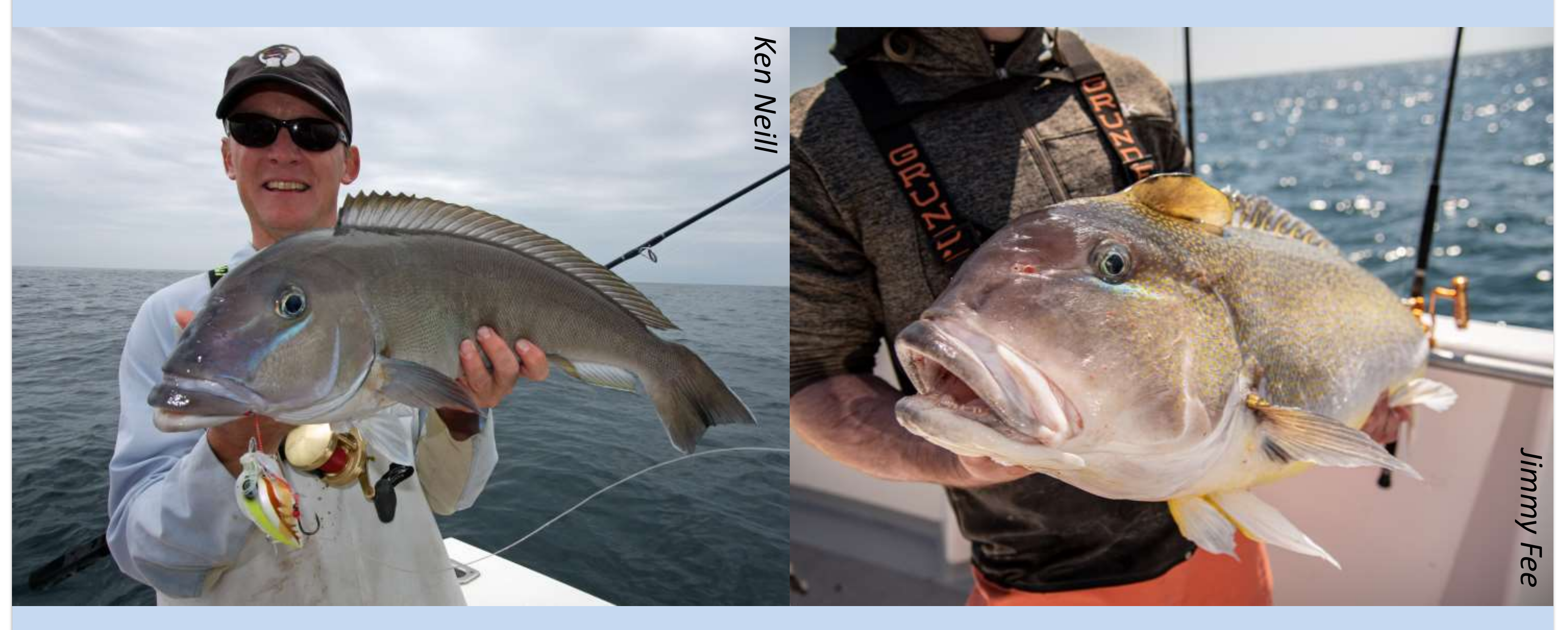
Blueline (or gray) tilefish (left) and golden tilefish (right).